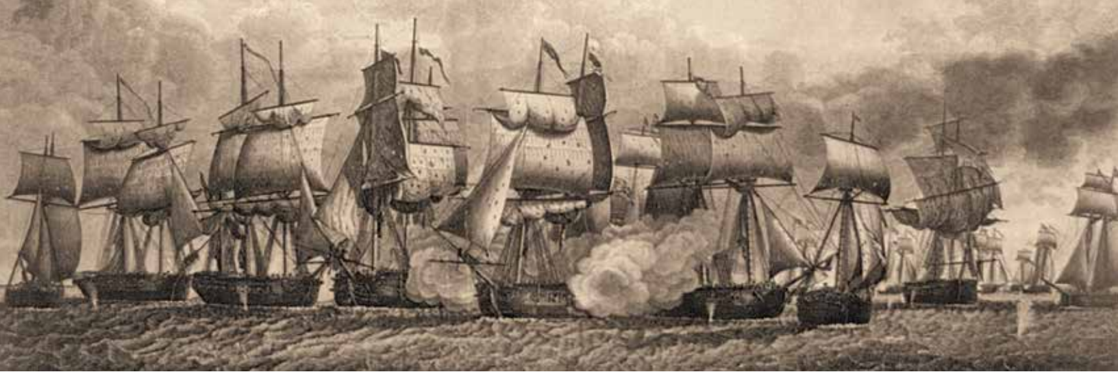
Perry's Victory Etching