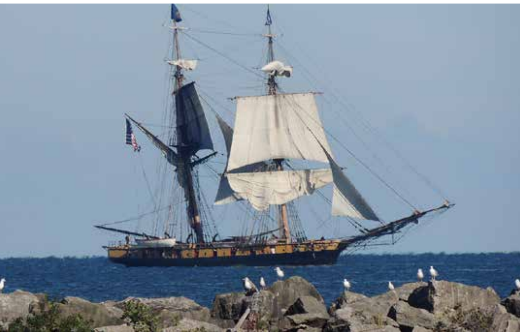
The U.S. Brig Niagara is home ported at the Erie Maritime Museum, Erie, PA.

For more information email: perrygroupinfo@gmail.com .